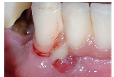
Suppuration around implant