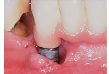
Exposed implant due to gum and bone loss

Both untreated and unsuccessfully treated peri-implantitis may lead to pain, a bad taste and increasing implant mobility. Eventually the implant, as well as teeth adjacent to the implant, may be lost. As well, significant bone loss around the implant jeopardizes the success of a new implant in the same site.